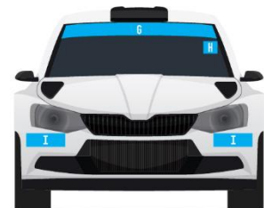
Diagram 1, shown on right (not to scale)